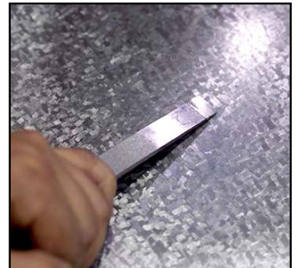
Hand Scraped Surfaces