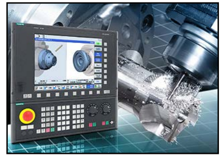
Siemens Control Panel